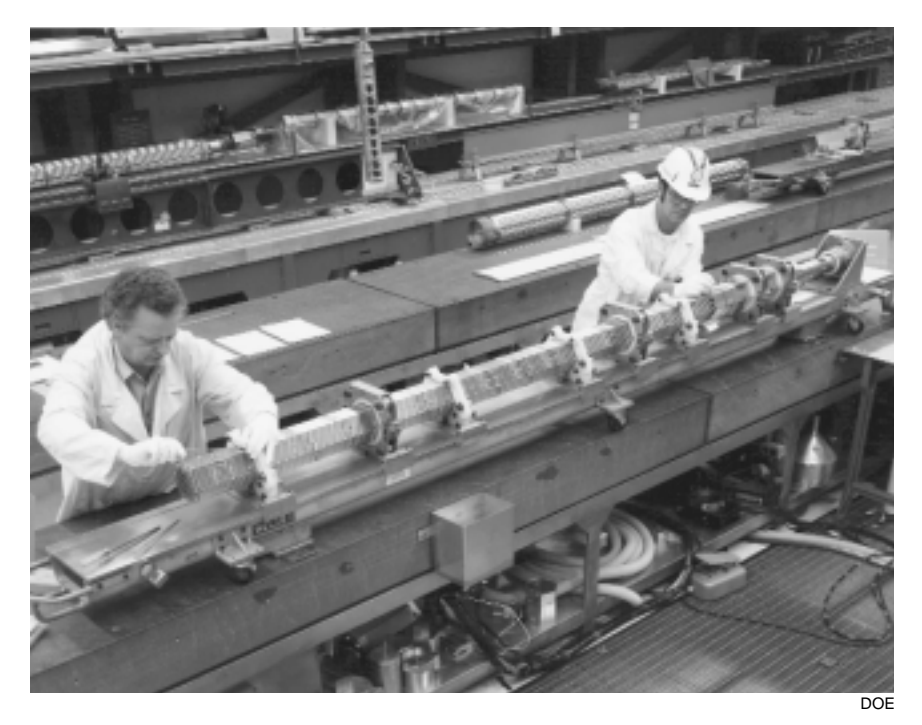
FFTF technicians in 1986, working on a fuel assembly. Each fuel pin is less than a quarter-inch diameter and about 8 feet long. The fuel pins are gathered into 217-pin assemblies, like the one shown here, which are housed in hexagonally shaped ducts in the reactor core.

nuclear "proliferation." The breeder reactor was labelled by its very nature as "bad." (In fact, when the FFTF, the nation's first industrial-size breeder reactor, achieved criticality—the start-up of the chain reaction—on Feb. 9, 1980, the anti-nuclear DOE didn't even take notice.)