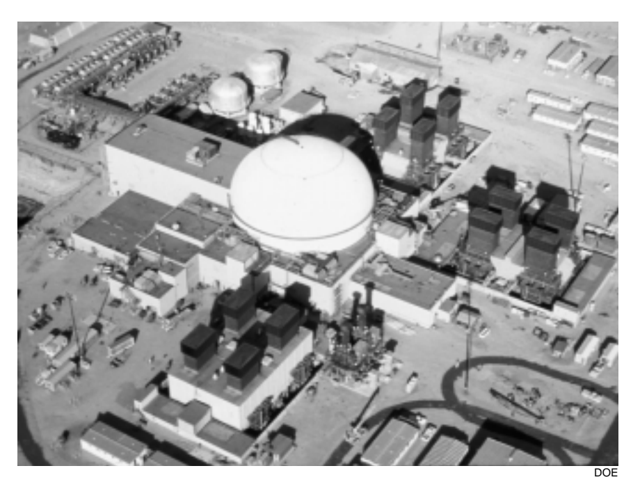
The Fast Flux Test Facility, at Hanford near Richland, Washington. The white dome is the containment building for the 400-megawatt test reactor.

be reversed. A group of FFTF supporters has been battling for years to save the FFTF, and to counter the fear-mongering of the anti-nukes as well as the cupidity of some local citizens who would prefer to get $2 billion in clean-up contracts from the DOE than to fight to save a key national research facility.